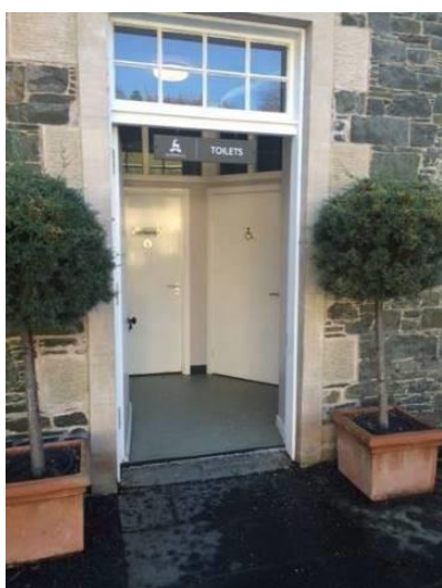
Toilet entrance from Courtyard