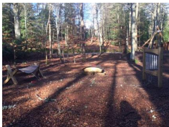
Giant xylophone, turtle drum and musical chimes