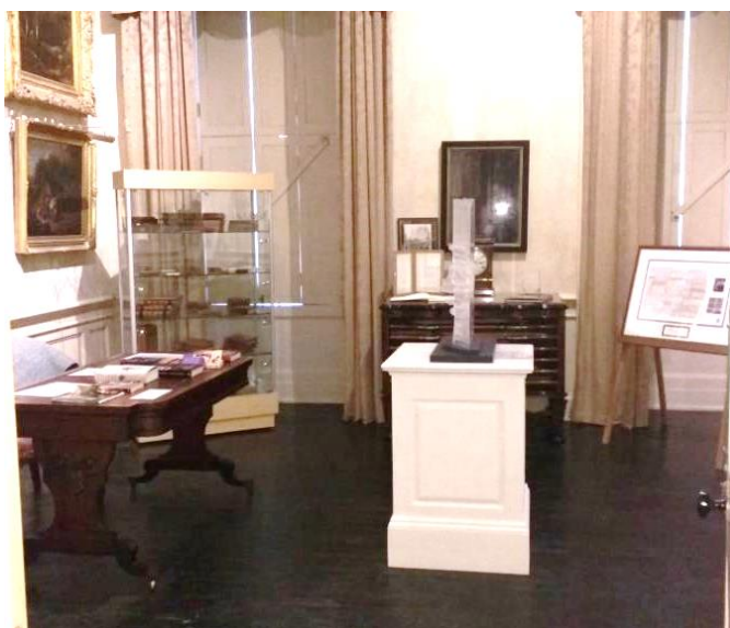
Limited room around the Scott Room