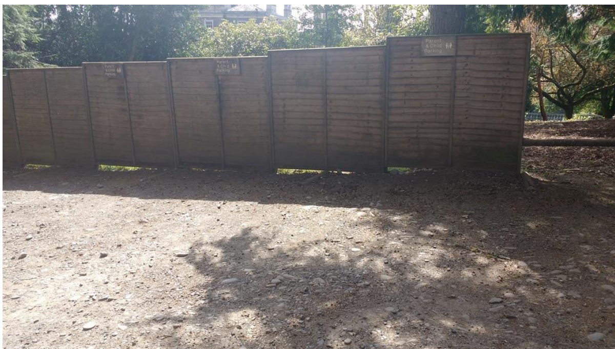
Parent and child parking spaces in the main car park giving extra room