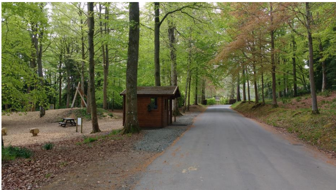
Entrance kiosk on the main drive in to Bowhill