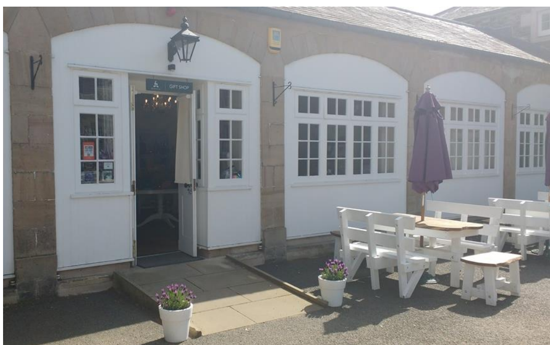
Gift Shop entrance