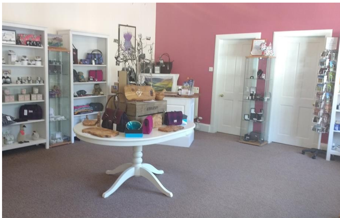
Gift Shop interior