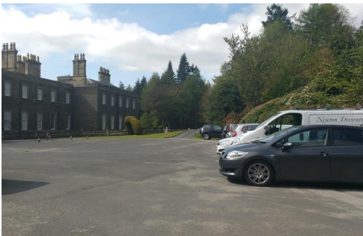
Accessible car park (shortest distance from Courtyard is approximately 90 metres)