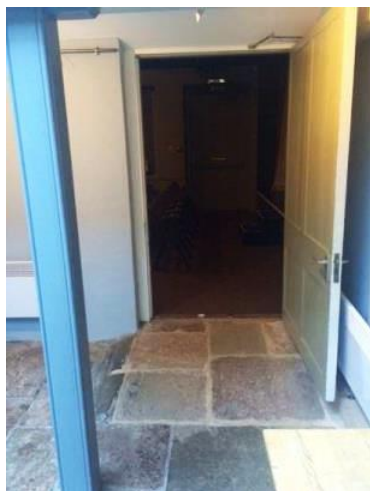
Entrance to Theatre