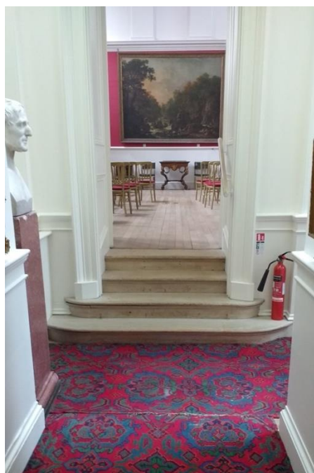
Steps to 'Old Chapel'