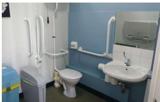
Interior of accessible toilet