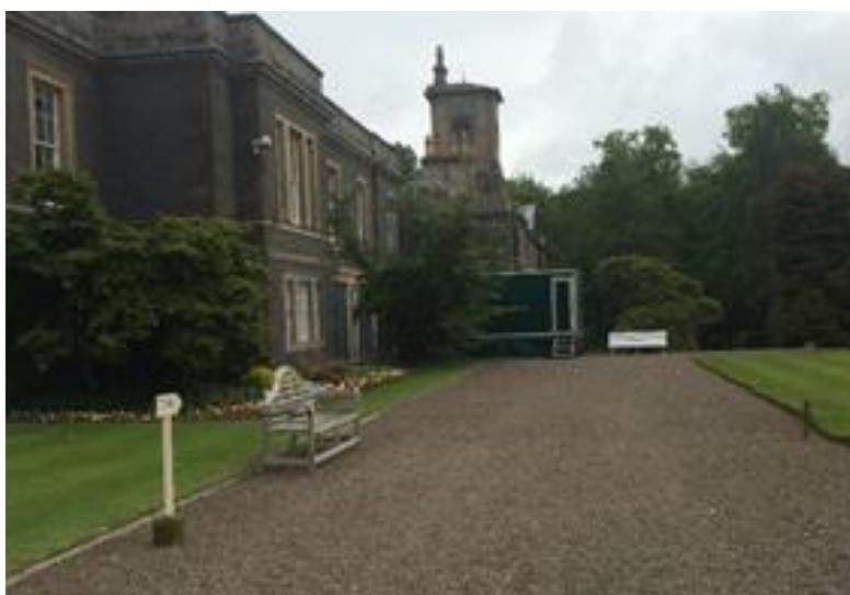
Path in front of Bowhill House