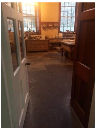
The Victorian Kitchen entrance