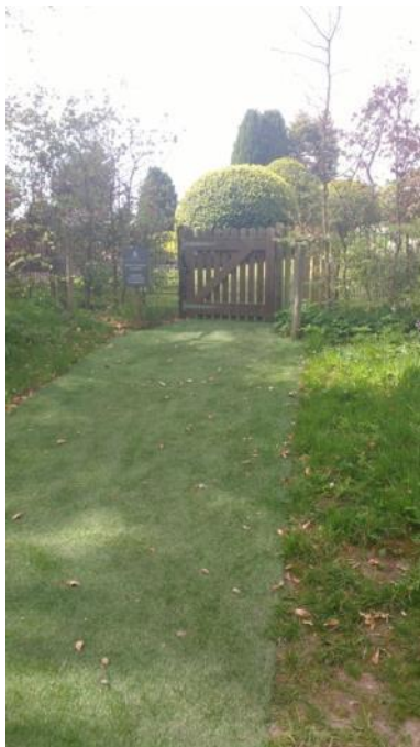
Slope to path