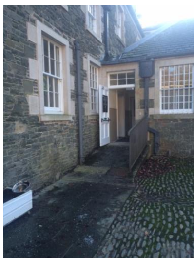
Access from Courtyard