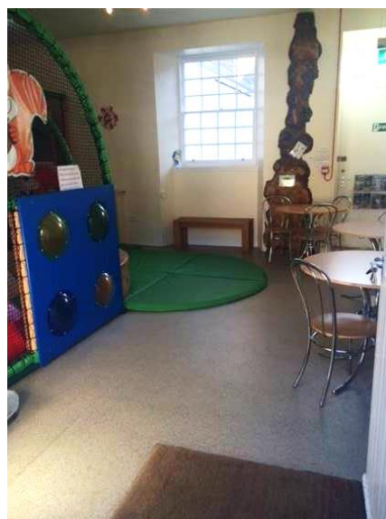
Soft Play entry and seating