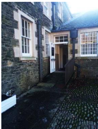
Access from Courtyard