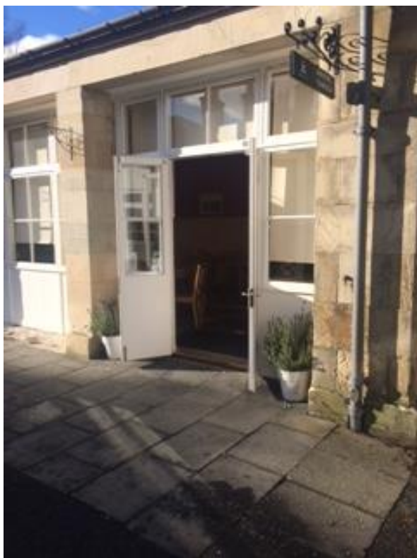
Entrance to Tearoom with small step

The Tearoom, accessed from the Courtyard, has a small step at the entrance.