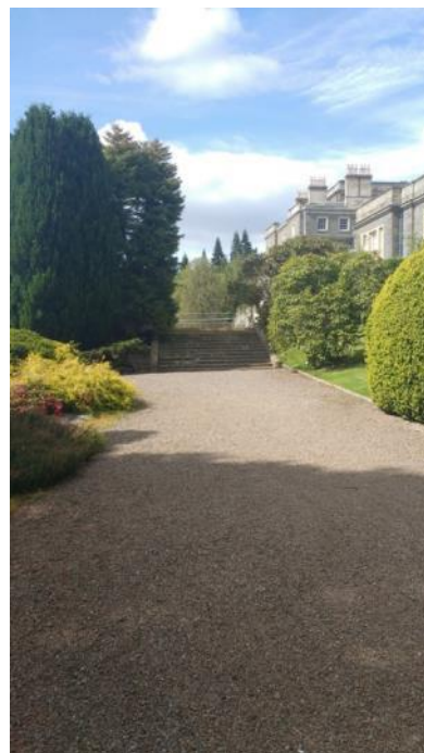
Gravel path leading to stone stairs