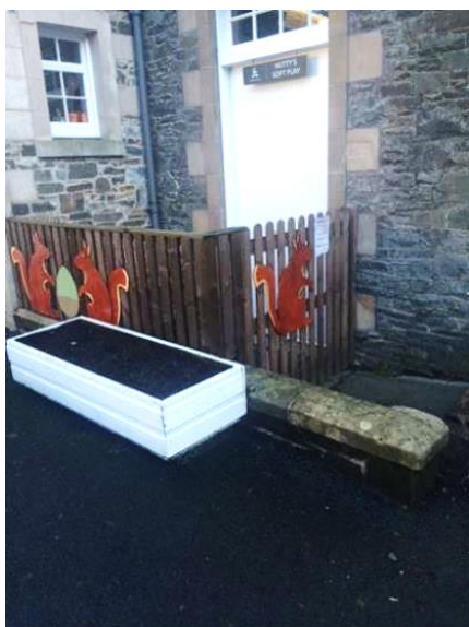
Access from Courtyard