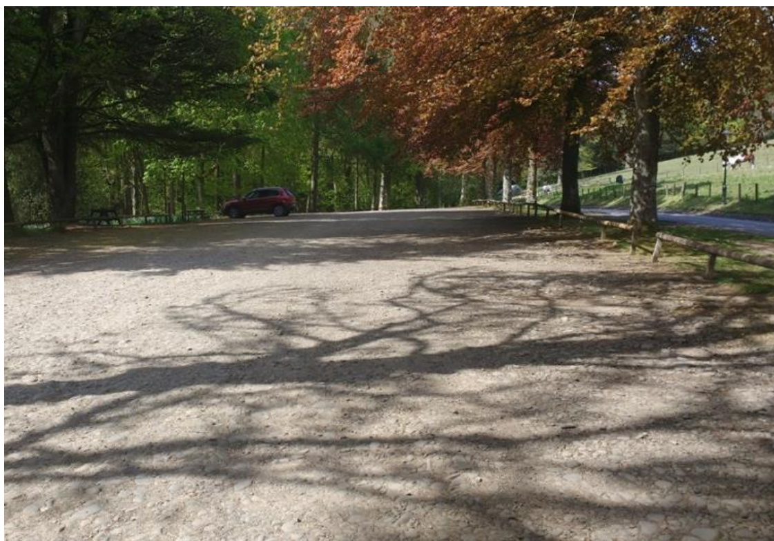
Main car park (shortest distance from Courtyard is approximately 102 metres)